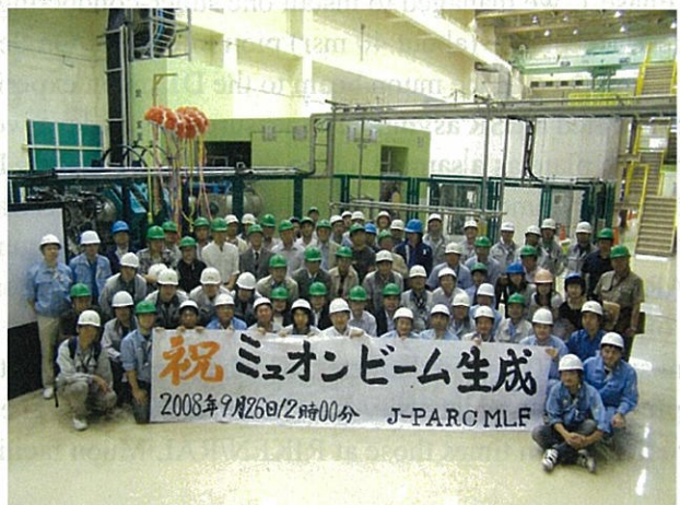
Fig. 3 A picture celebrating the first muon beam production at J-PARC MUSE.