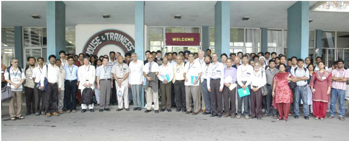
Group Photograph on Oct 4, 2010 at Training School Hostel, Anushaktinagar, Mumbai