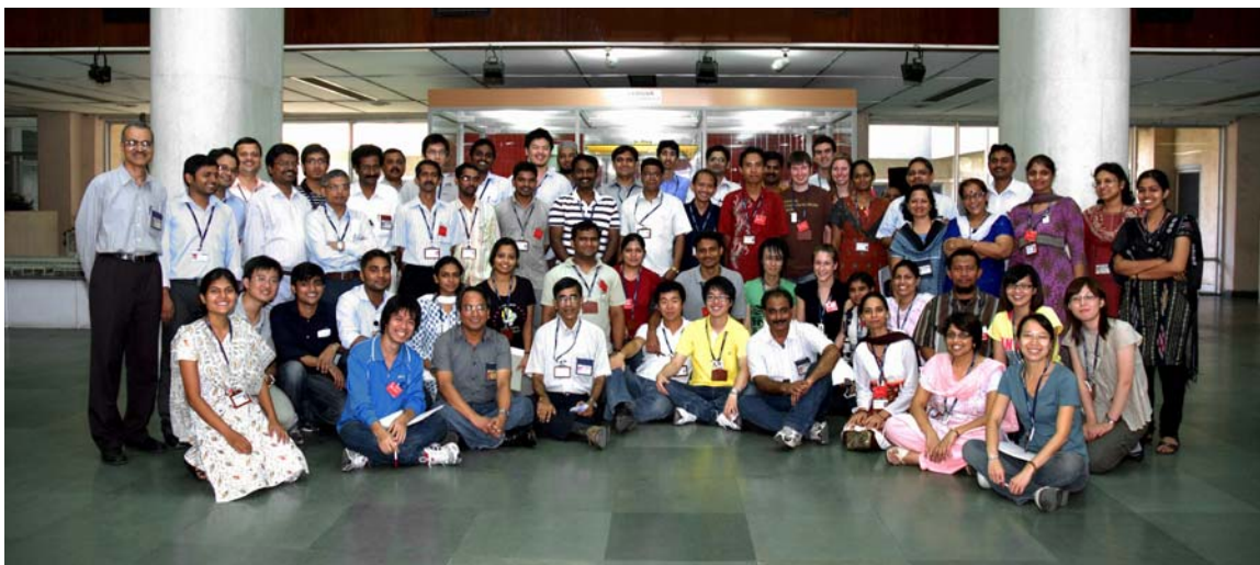
Group Photograph on Oct 7, 2010 at Dhruva Reactor lobby, BARC, Mumbai